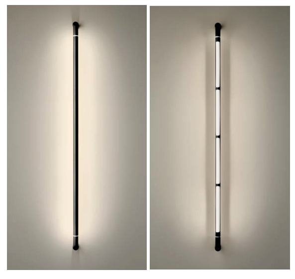
Pictures above might not show the specified dimensions or material. They are for illustration purposes only.