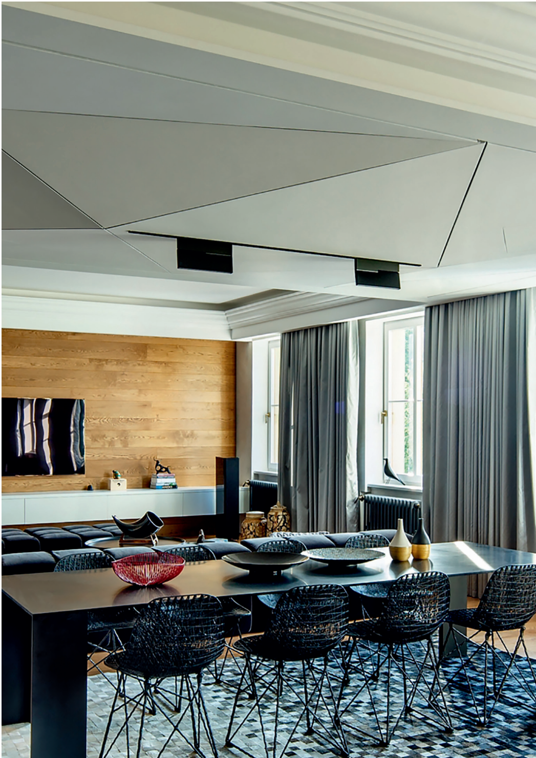
°knick / Men's Choice II, Slovakia - architects AT26 - photograph by Jakub Dvorak