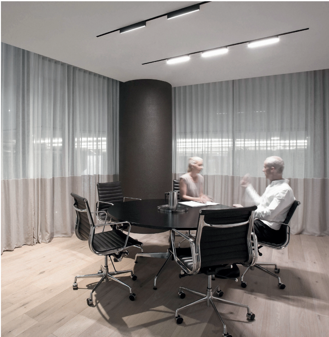
°out / office, Australia