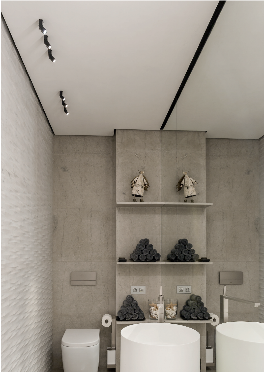
°dot monopoint with plasterkit / Grey Perfection, Moscow - architect Dina Mezheva