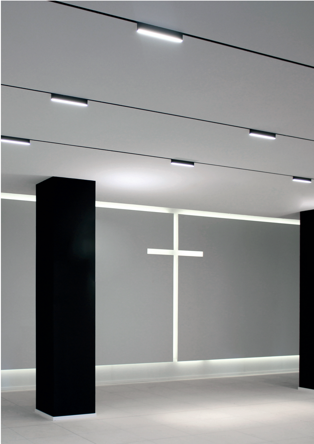
°out / Church Genk, Belgium - architect PCP Architects