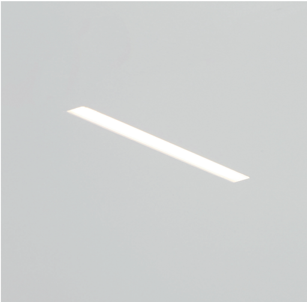
°in monopoint with plasterkit