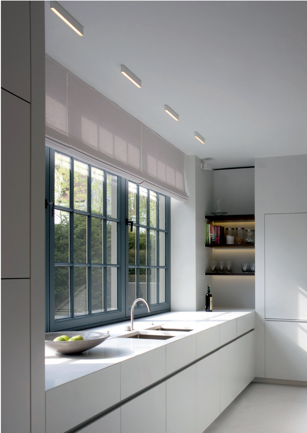
°out monopoint with plasterkit / Beach house Knokke - architect Glenn Reynaert