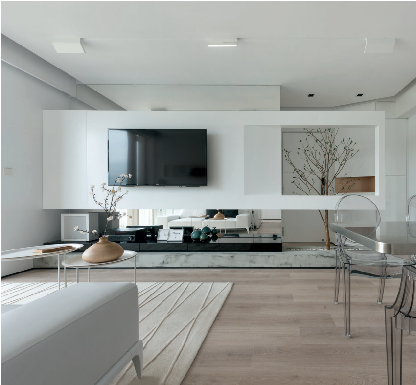
*knick / Harbour Green, Hong Kong - architect Millimeter Interior Design Limited