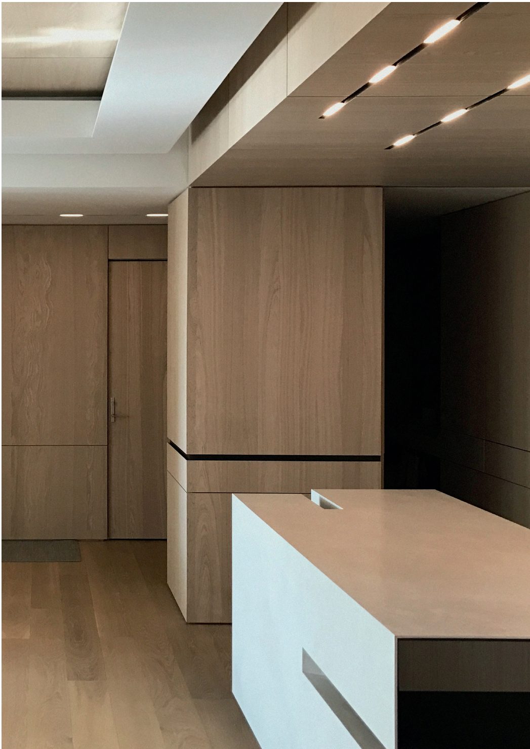
*in / Regency NY - architect Workshop APD - custom building contractor Dutchman Contracting, Inc.