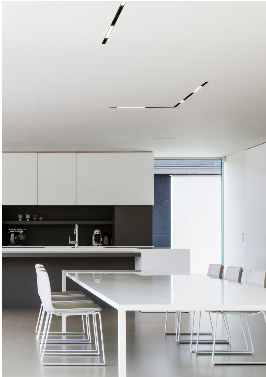
°online / Villa V, Belgium - architect Francisca Hautekeete - photograph by Annick Vernimmen