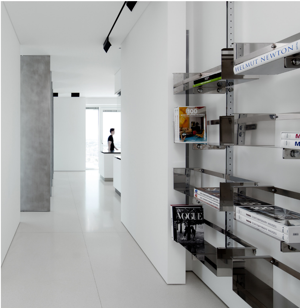
°knick & °knick monopoint / GR-apartment - architect Pitsou Kedem (Tan Broides)