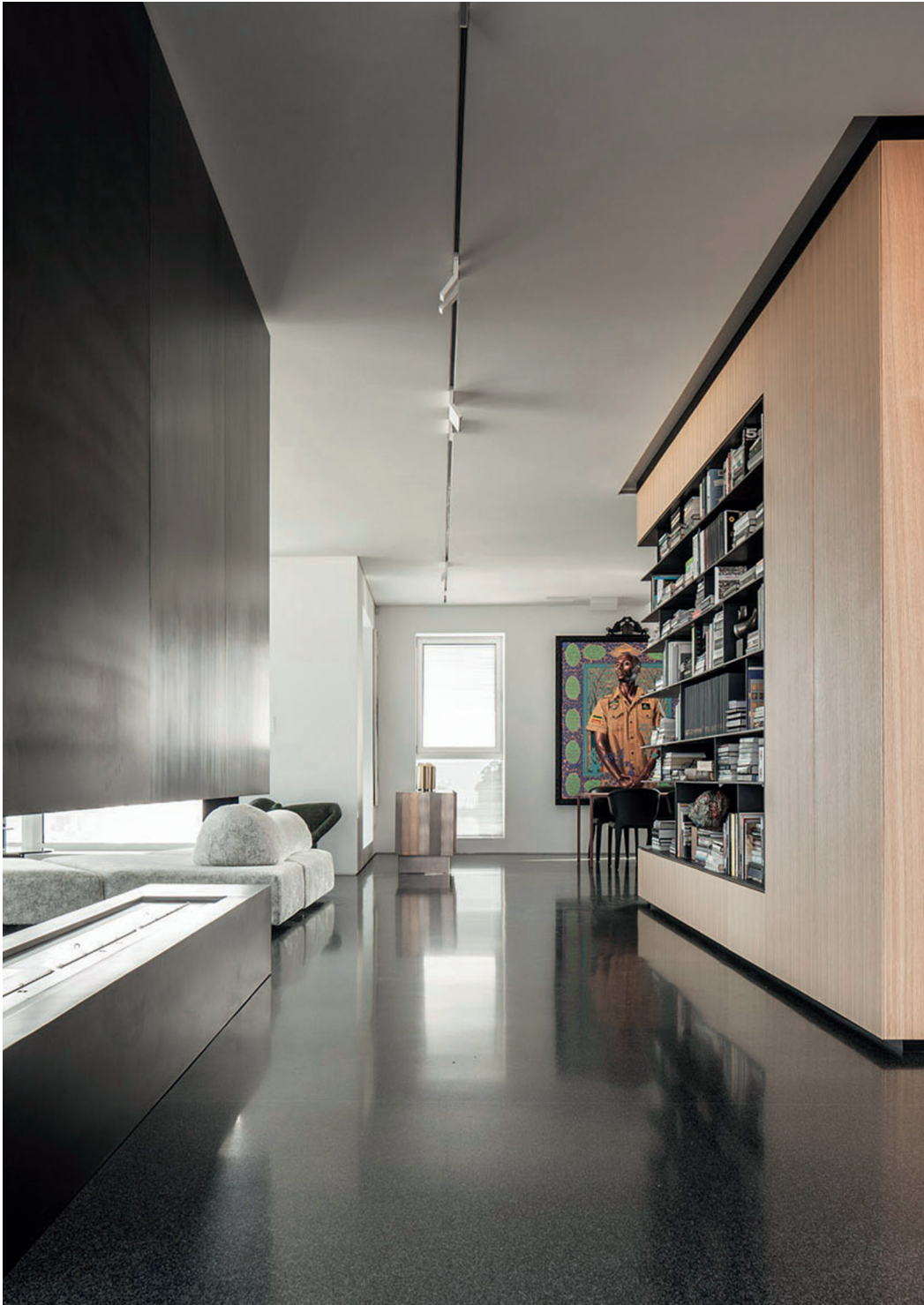
*turn / apartment, Israel - architect Pitsuo Kedem - ST-OR - lighting design Orly Avron