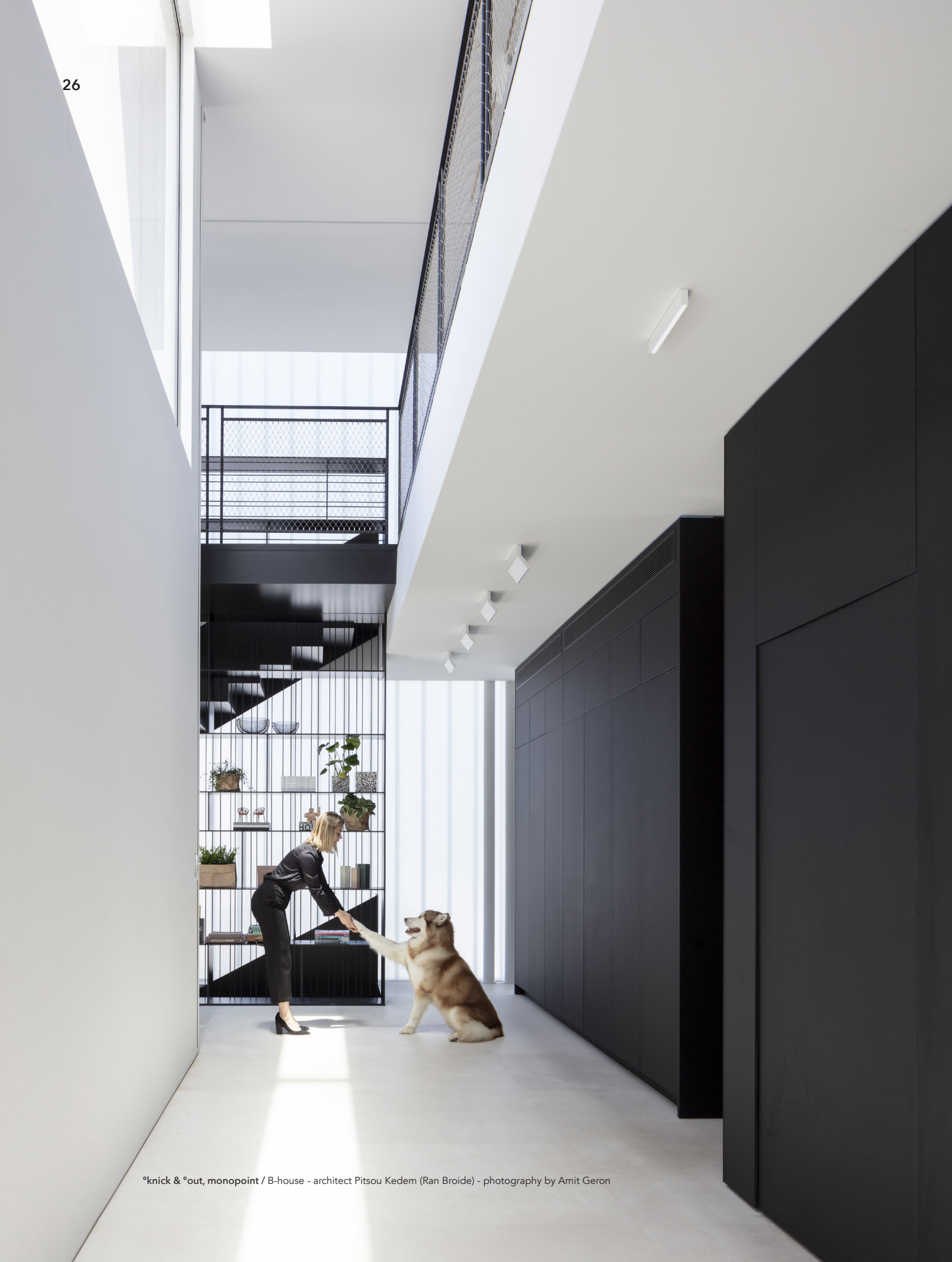
°knick & °out, monopoint / B-house - architect Pitsou Kedem (Ran Broide)