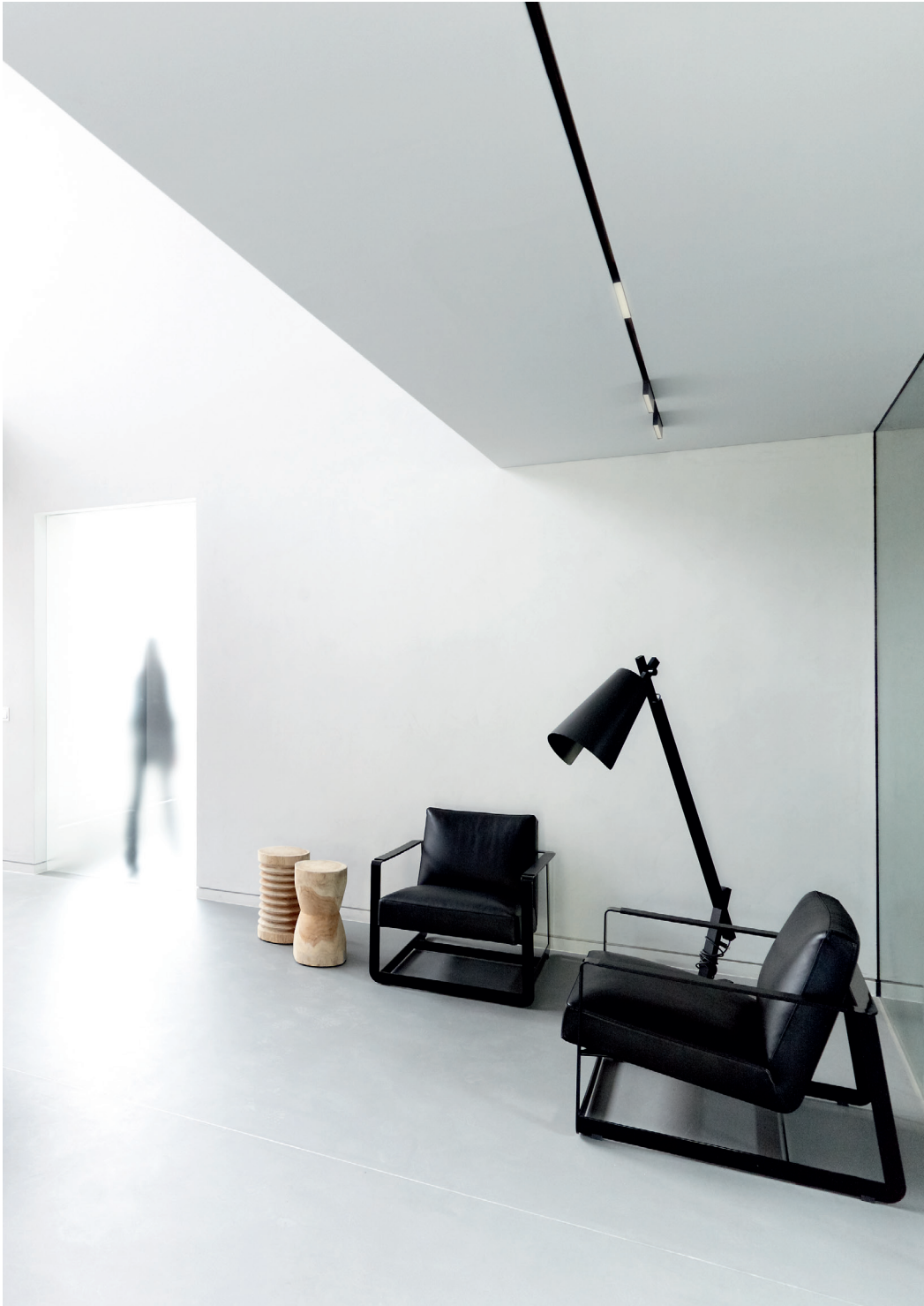
°online / Grey Office, Greece - architects eDje