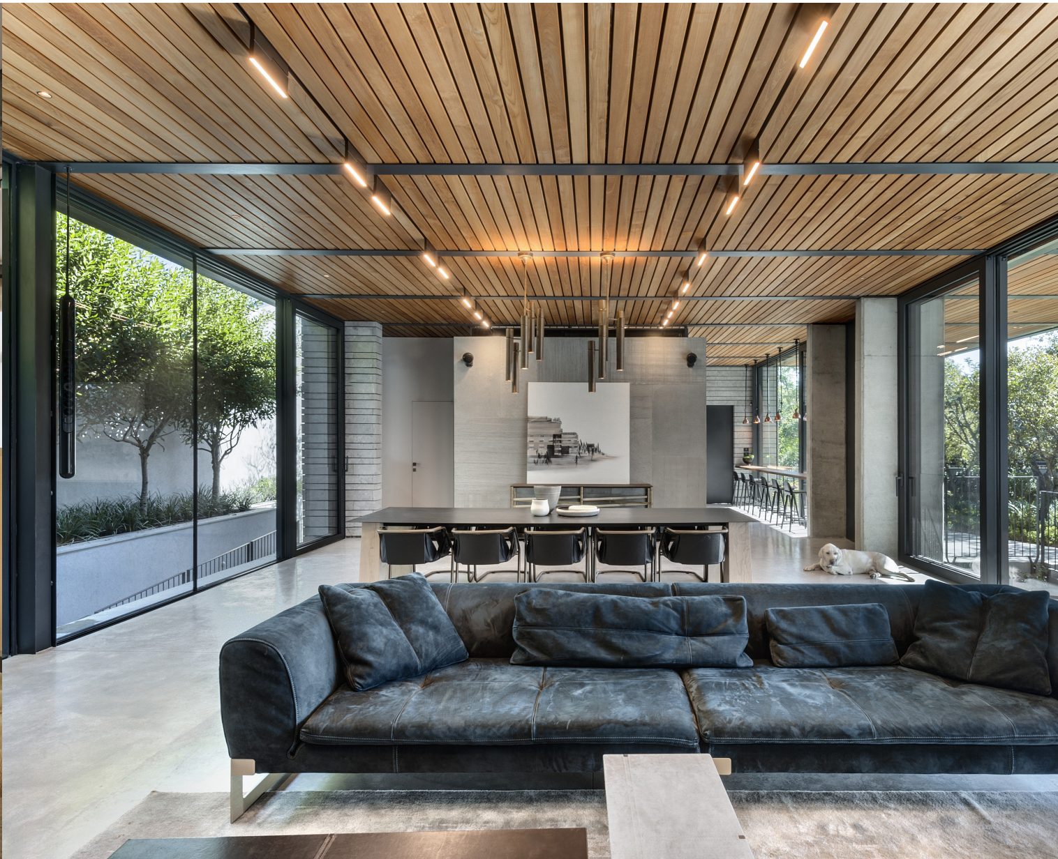
°knick / T House, TLV, Israel - design by Orly Dekter