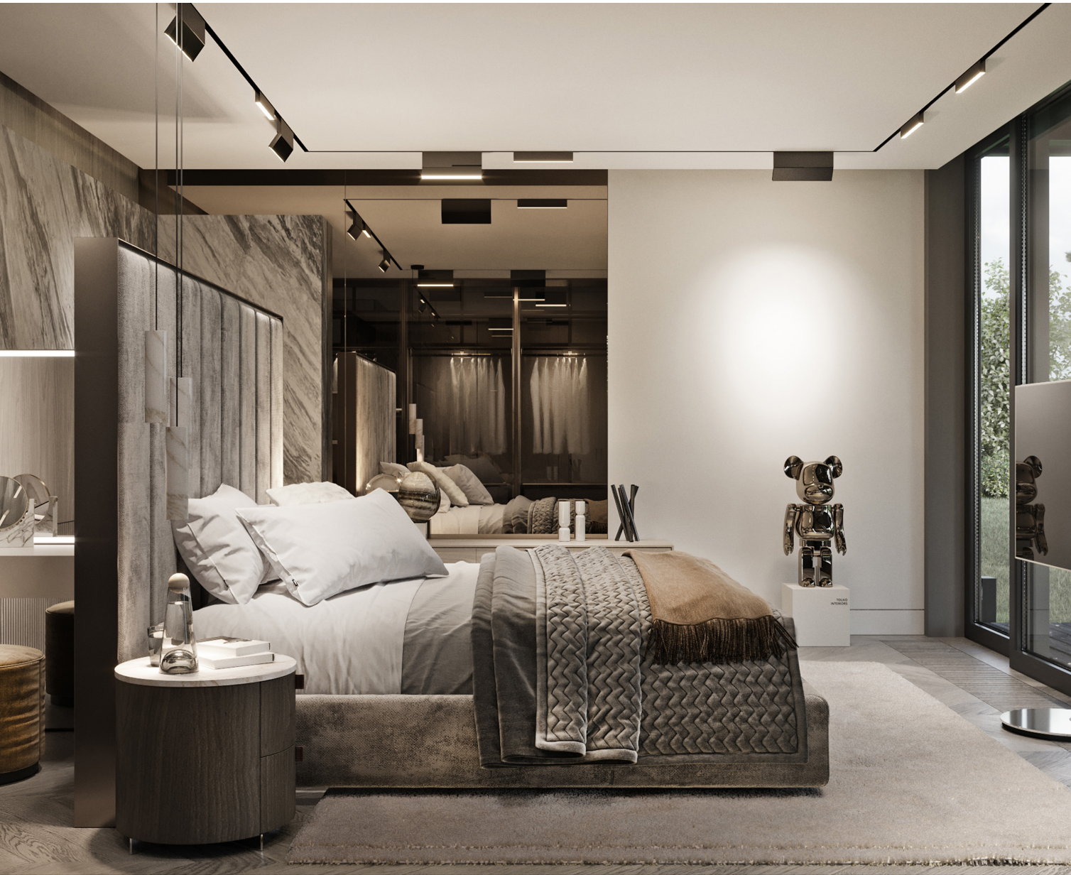
*knick & out / Osko Village, St. Petersburg - architect Tolko Interiors