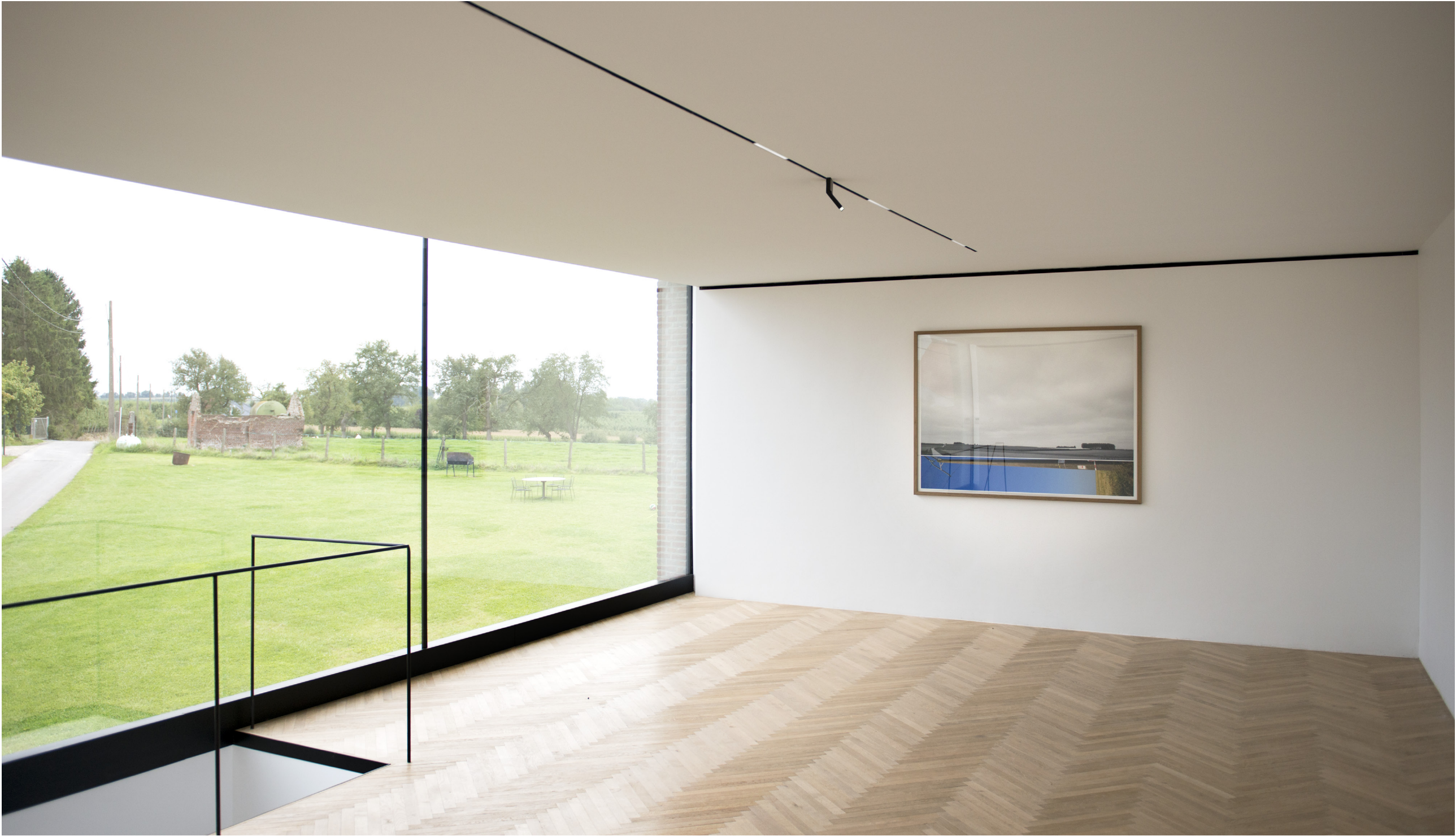
°in & °turn / Gert Robijns - Reset Home, centre for contemporary art