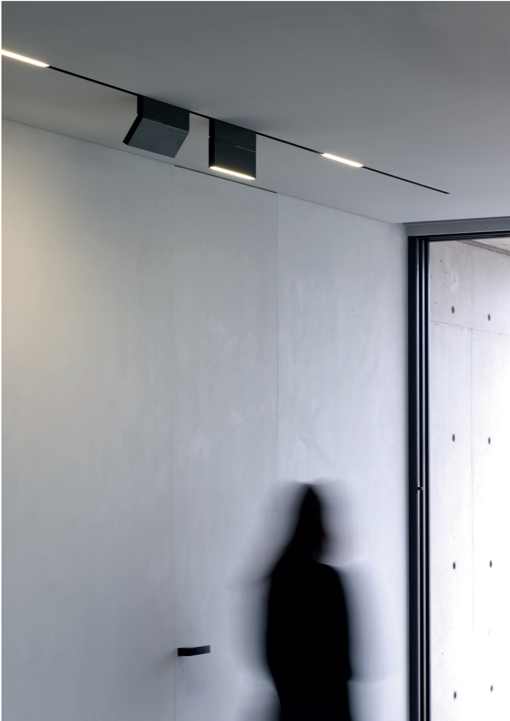
°online / Grey Office, Greece- architects eDje