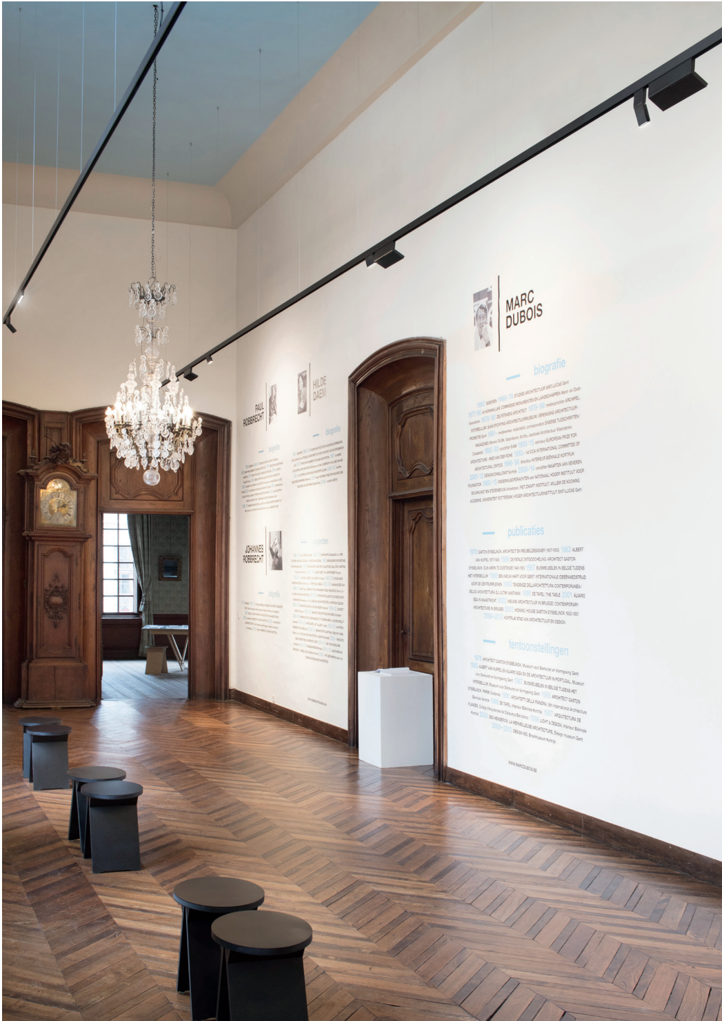
°online suspended track / Design Museum Gent, Belgium