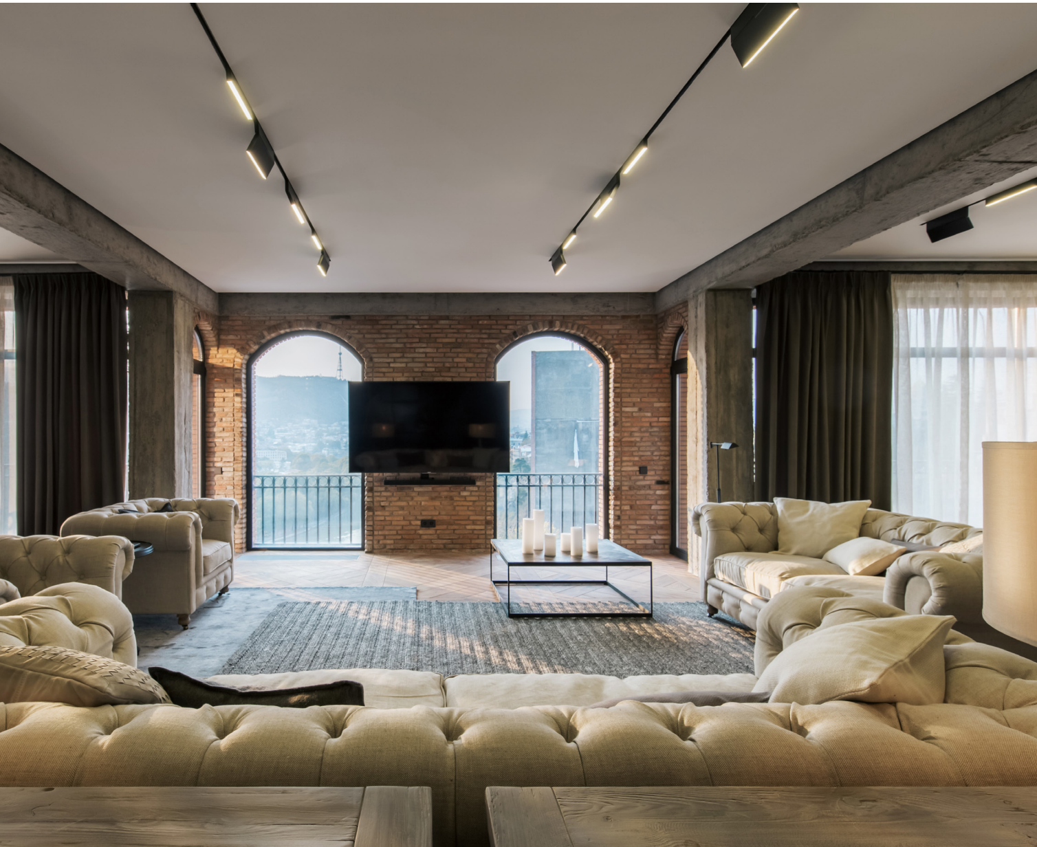
°out & °knick / Apartment, Tbilisi, design by Yodezeen