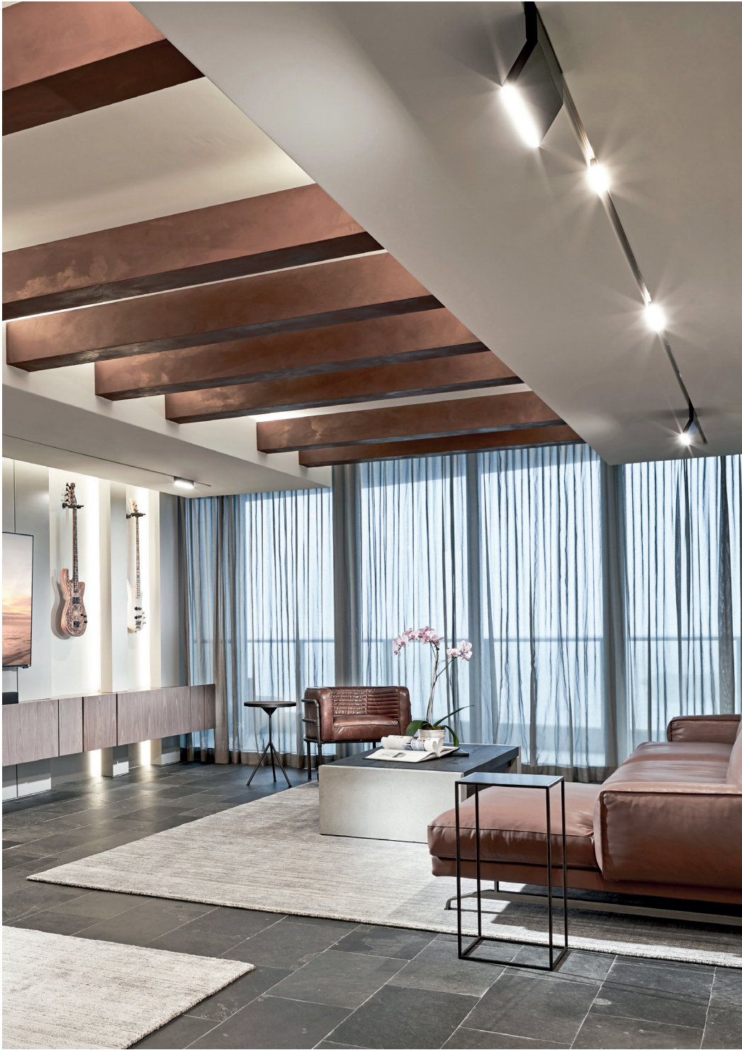
°knick / Grosvenor House Coconut Grove, Miami - RS3 Design - Luxe Cable + Light