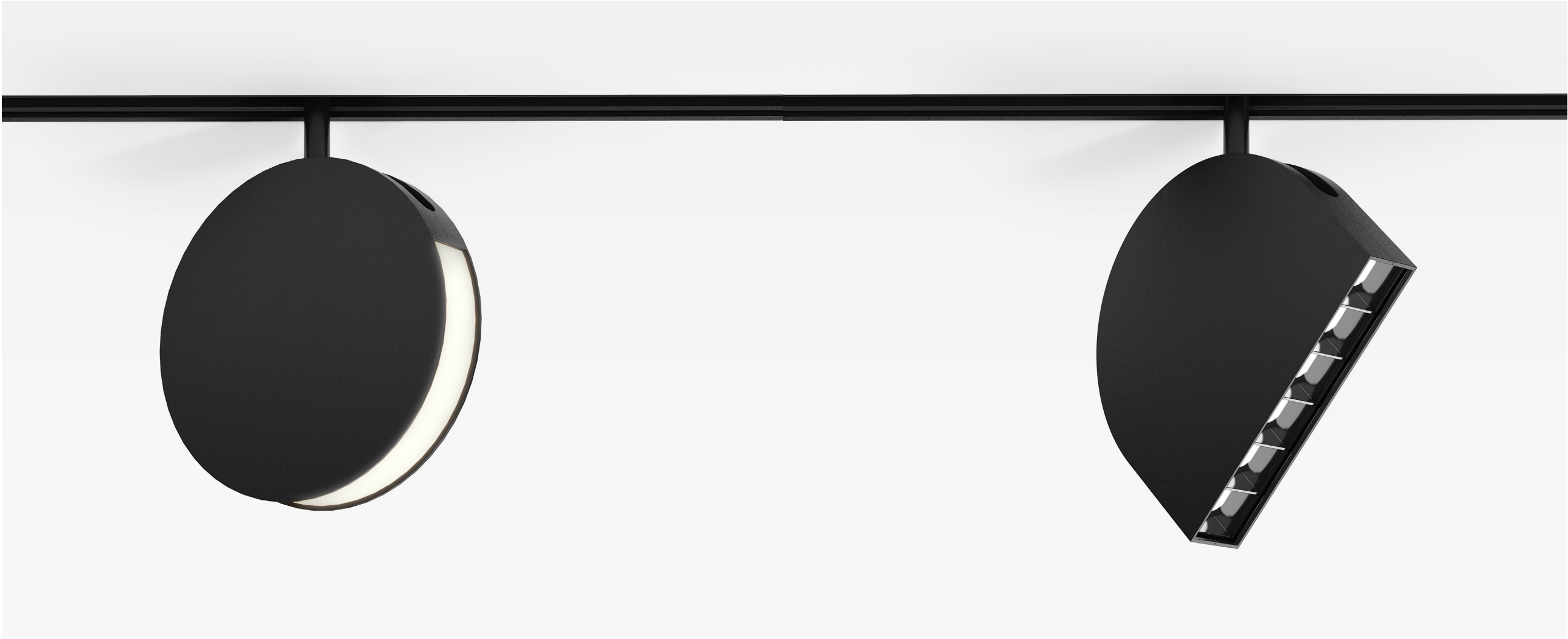
°o-disk / general lighting