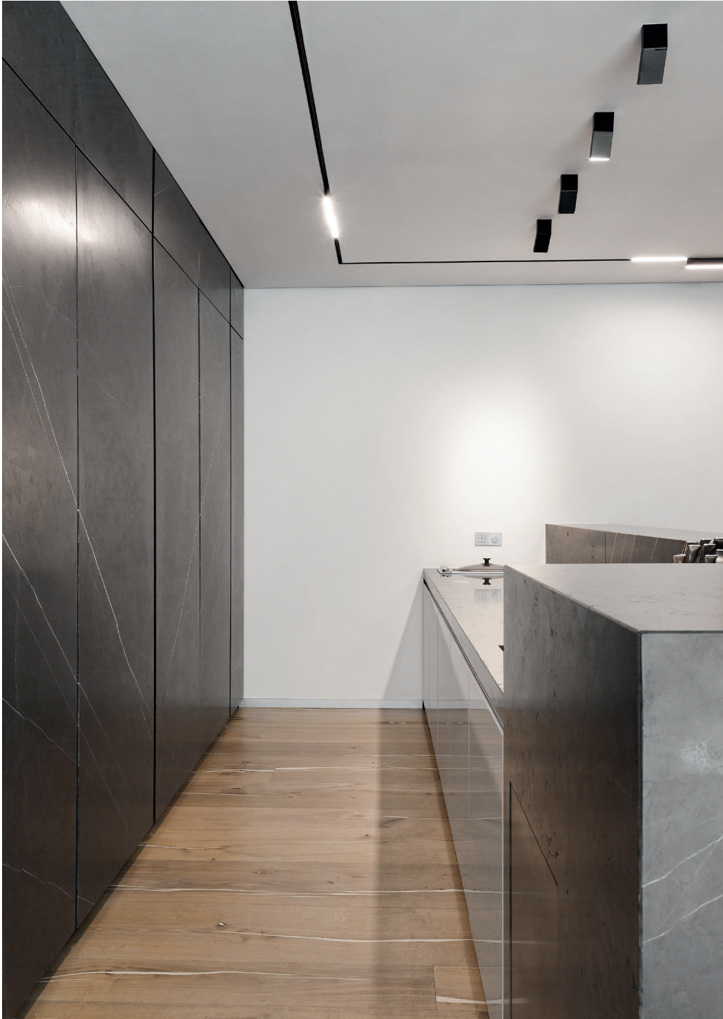
°turn monopoint with plasterkit & °knick / Grey Perfection, Moscow - architect Dina Mezheva