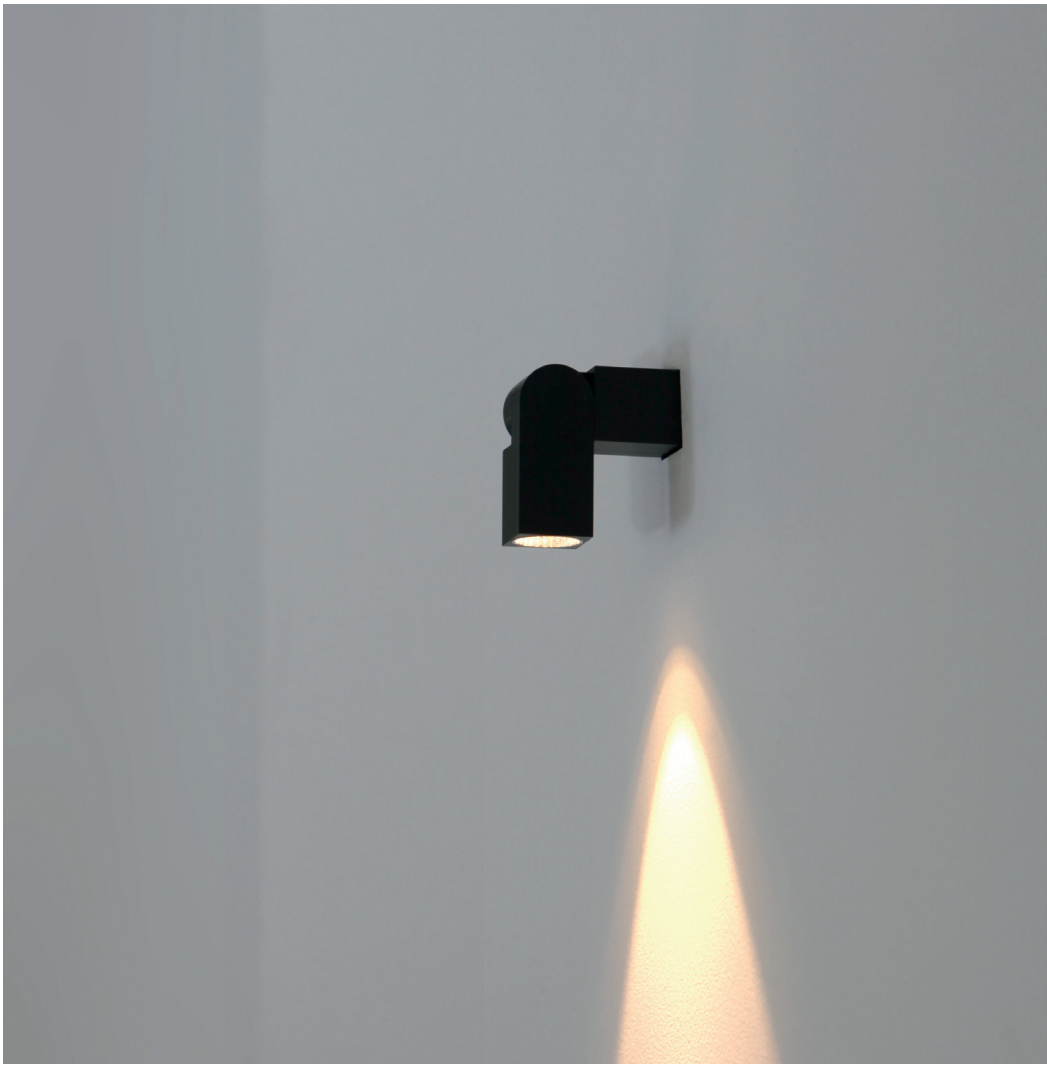
°dot monpoint with plasterkit