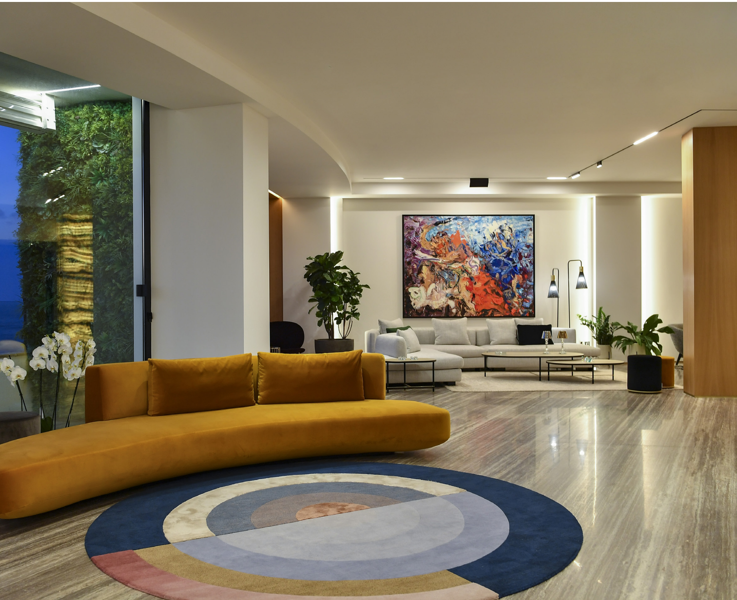
*knick & °in / Beach house, Tripoli, Lebanon - design by Minkara Sahar - The Light Avenue by Debbas