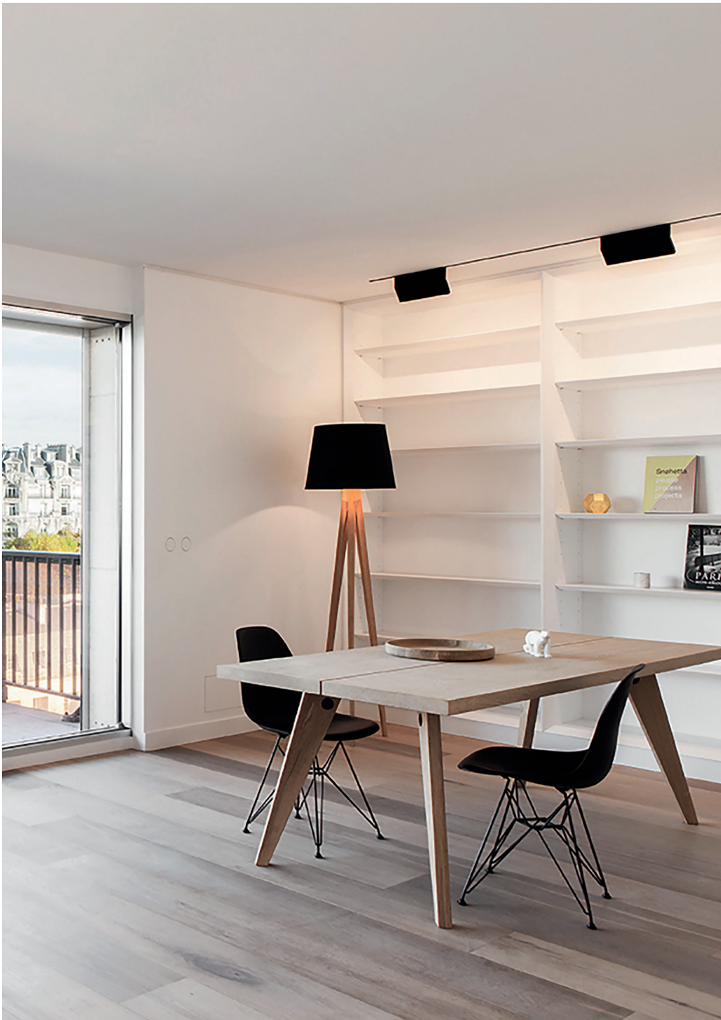
°knick / Apartment, Paris - architect Angelo View Drive