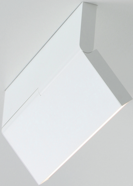
°knick monopoint with plasterkit