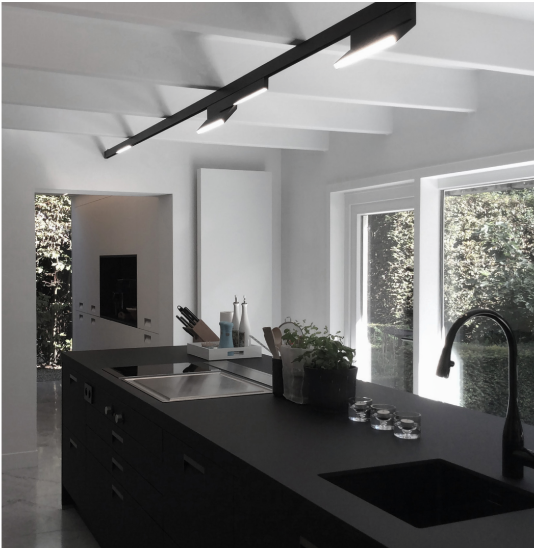
°online surface mounted / House, Belgium - architect Project B