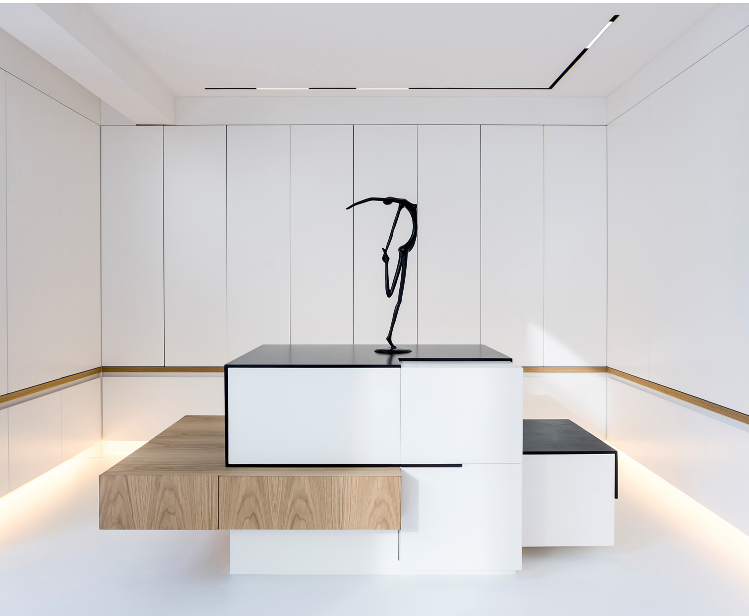
*in / Loft à Versailles - architect Agence Demont Reynaud / PPil