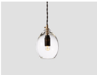
Unika small transparent – Item no. 530