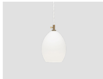
Unika small white – Item no. 532