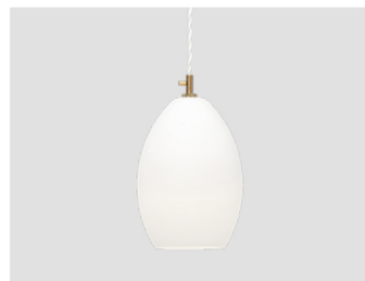
Unika large white – Item no. 533