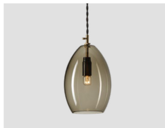
Unika large grey – Item no. 536