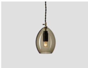
Unika small grey – Item no. 535