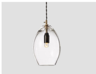
Unika large transparent – Item no. 531