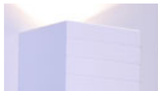
Mat White Paint