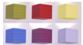
Mat Colour Paint