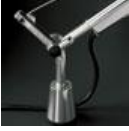
TOLOMEO SUPP.TAVOLO FISSO A004200