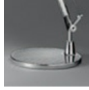
TOLOMEO BASE TV ALL D230 A004030