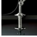
TOLOMEO MORSETTO A004100