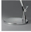
TOLOMEO BASE TV ALL D230 A004030