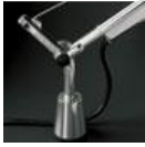
TOLOMEO SUPP.TAVOLO FISSO A004200