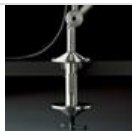
TOLOMEO MORSETTO A004100