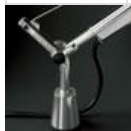
TOLOMEO SUPP.TAVOLO FISSO A004200