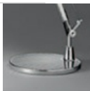
TOLOMEO BASE TV ALL D230 A004030