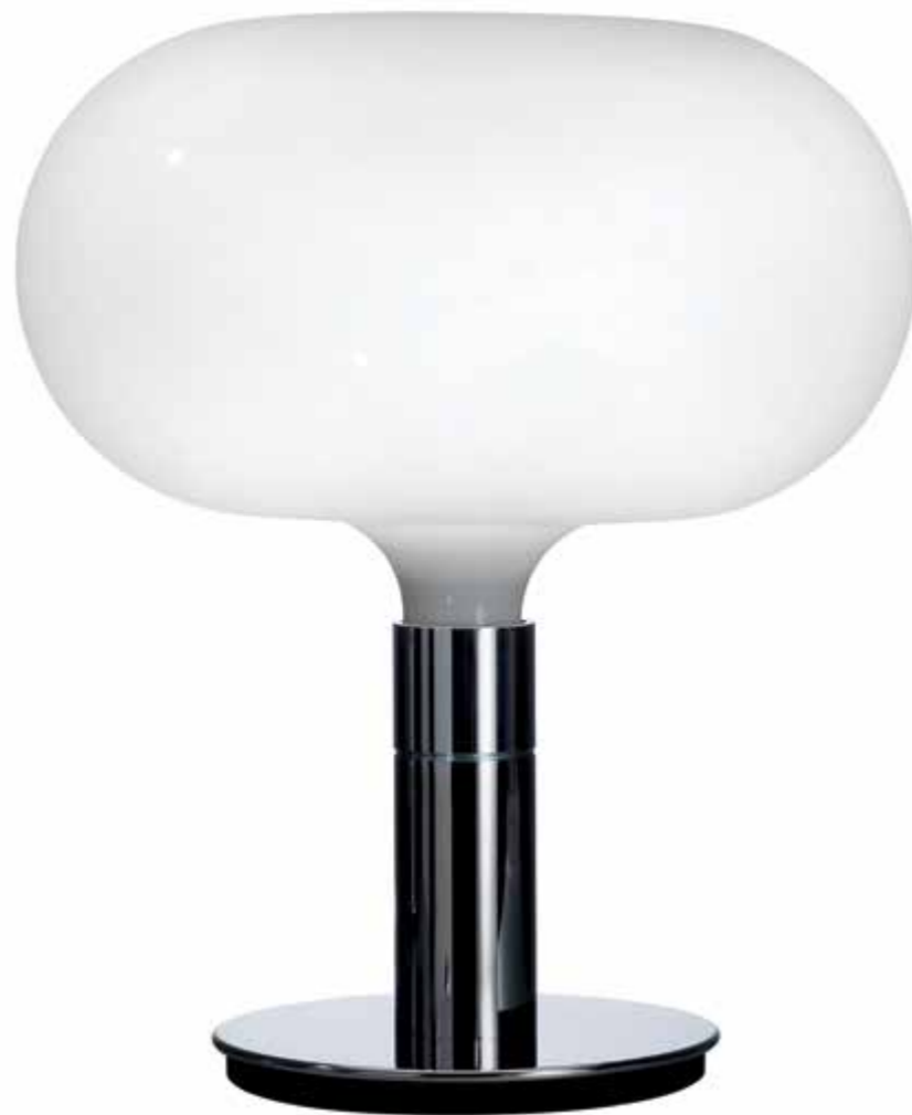
TABLE E27 FLUO/LED/HALO