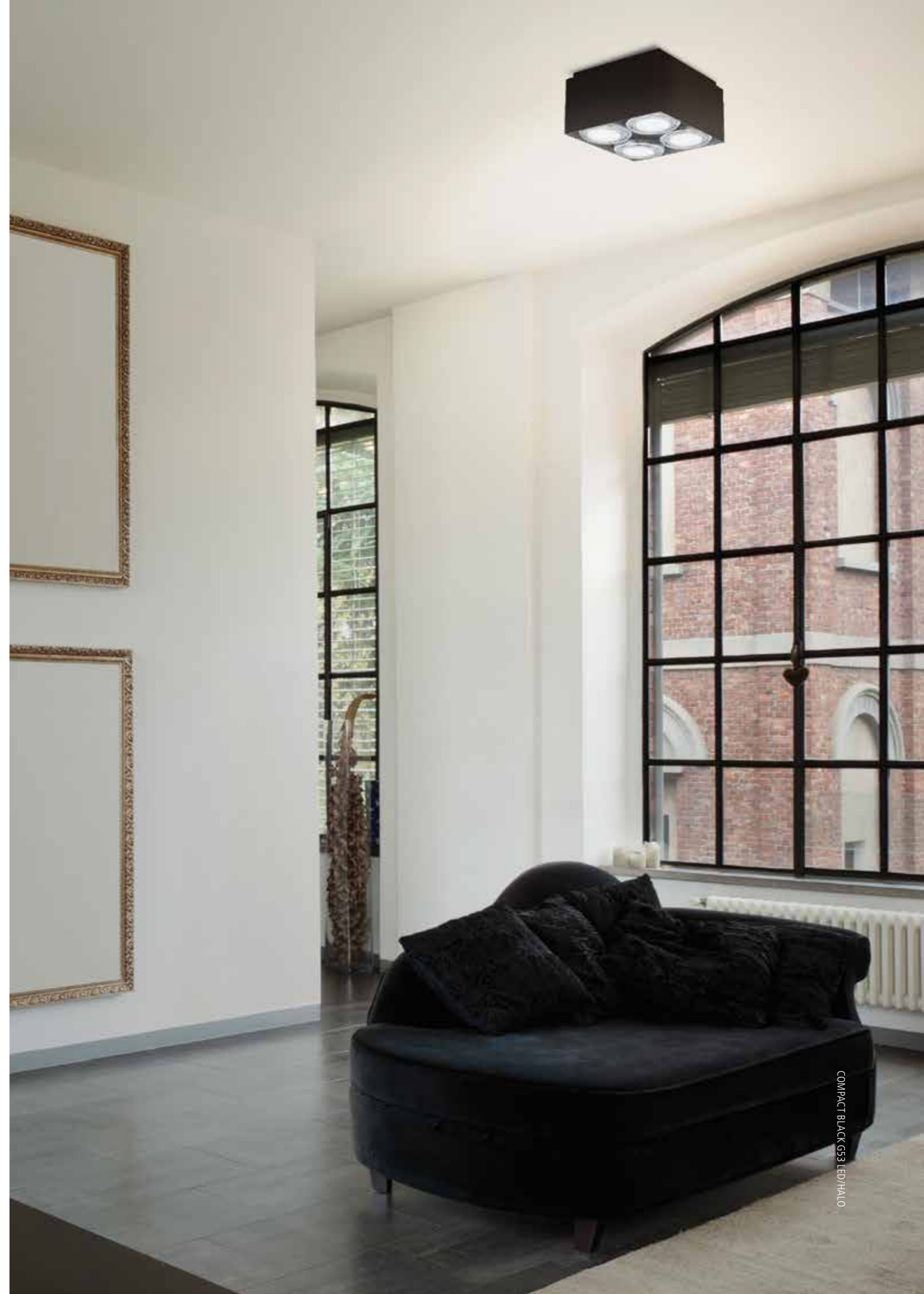
COMPACT BLACK G53 LED/HALO