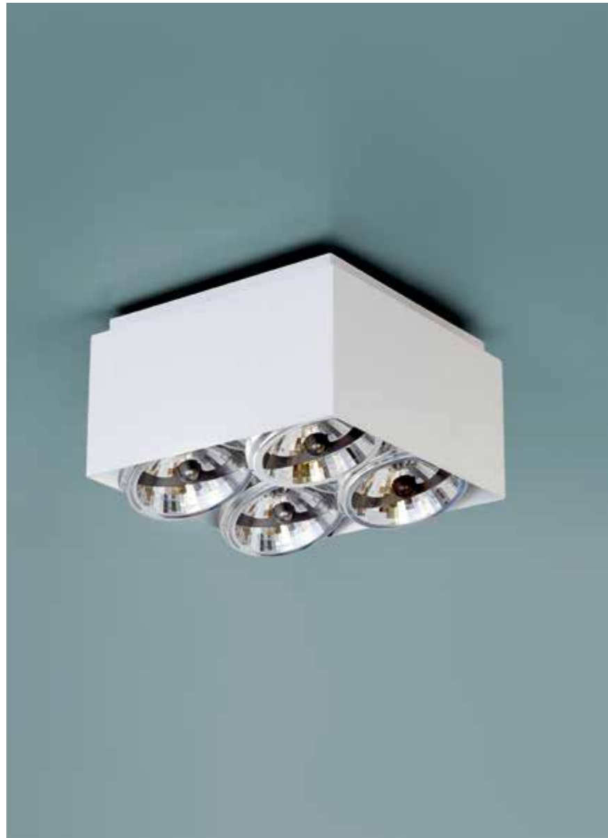
COMPACT WHITE G53 LED/HALO