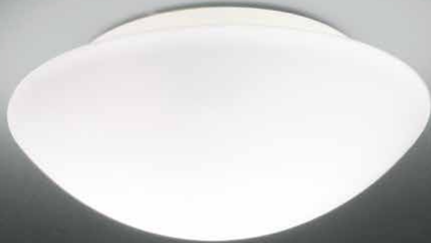
JESOLO WITH EMERGENCY KIT