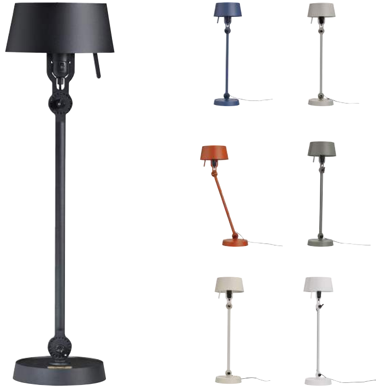
BOLT TABLE LAMP - REGULAR