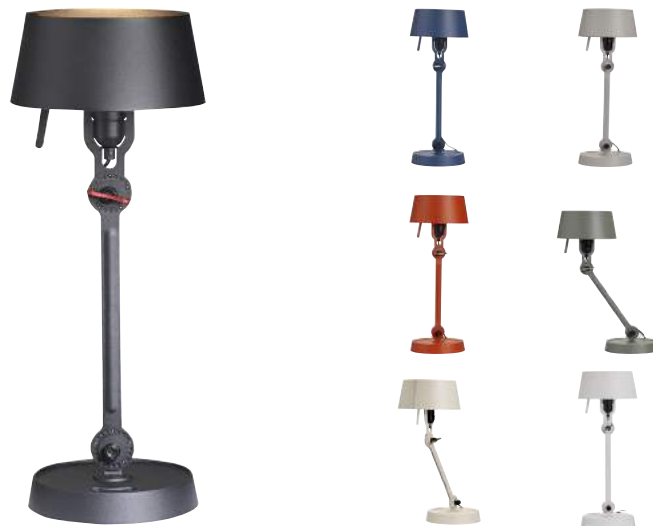
BOLT TABLE LAMP - SMALL