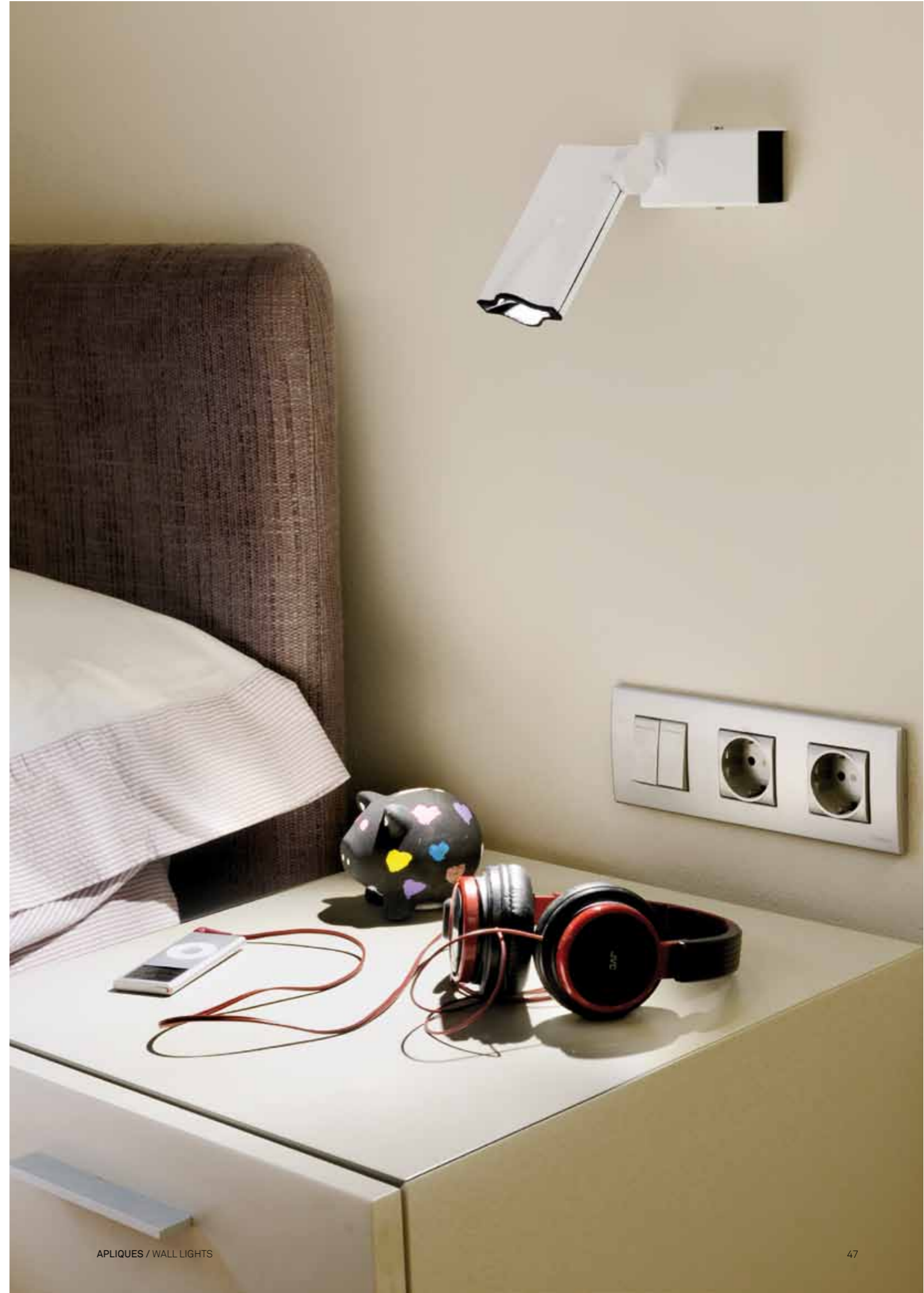
APLIQUES / WALL LIGHTS